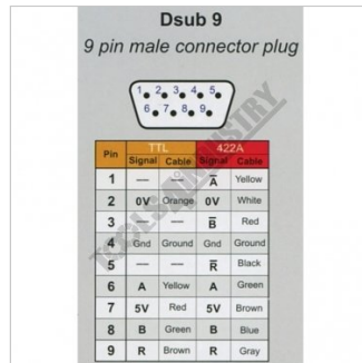
Dsub9 Wiring Diagram