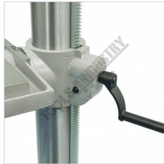
Table Height Adjustment Crank