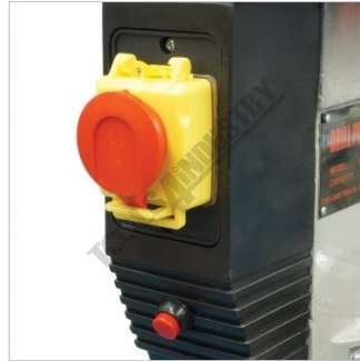
Emergency Stop Switch and Light Switch