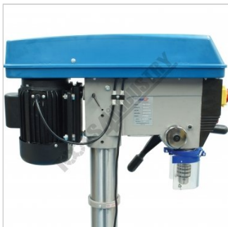
Head Side View