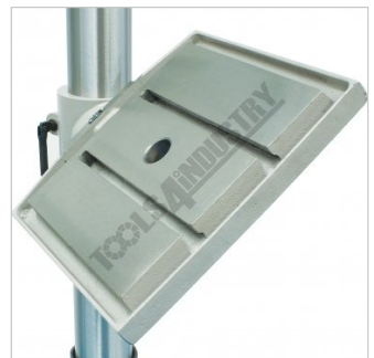
Tilting and Rotating Cast Iron Table