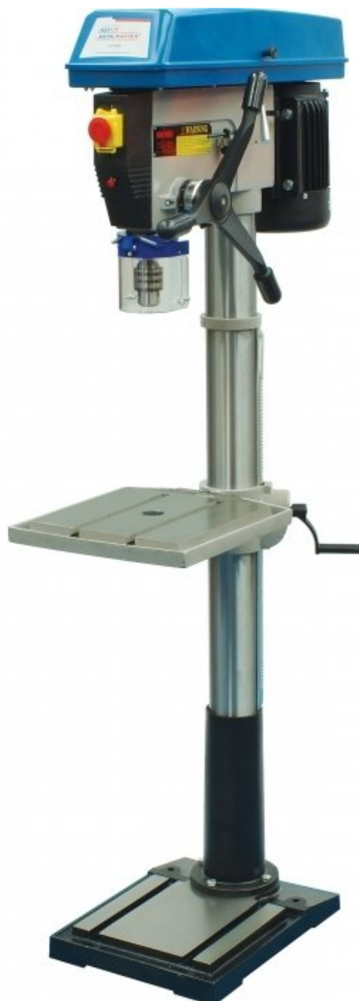
Table Tilts Left & Right To 45°