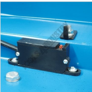
Safety Micro Switch on Pulley Guard