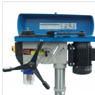
A Section Belt Drive System