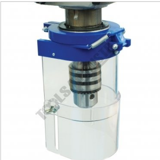
Adjustable Safety Chuck Guard with Flip Up Screen