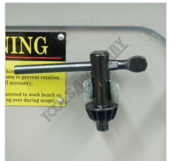
Chuck Key Holder