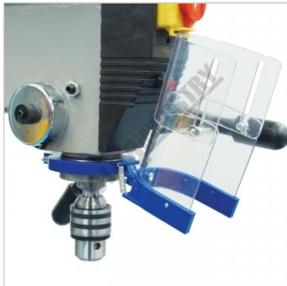
Safety Chuck Guard Flipped Up