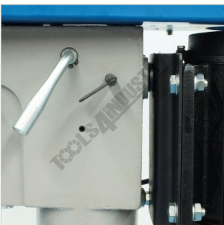
Belt Tension Lever and Lock