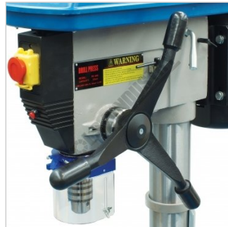
1 Piece Cast Iron Drilling Lever