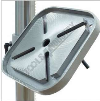
Tilting and Rotating Cast Iron Table