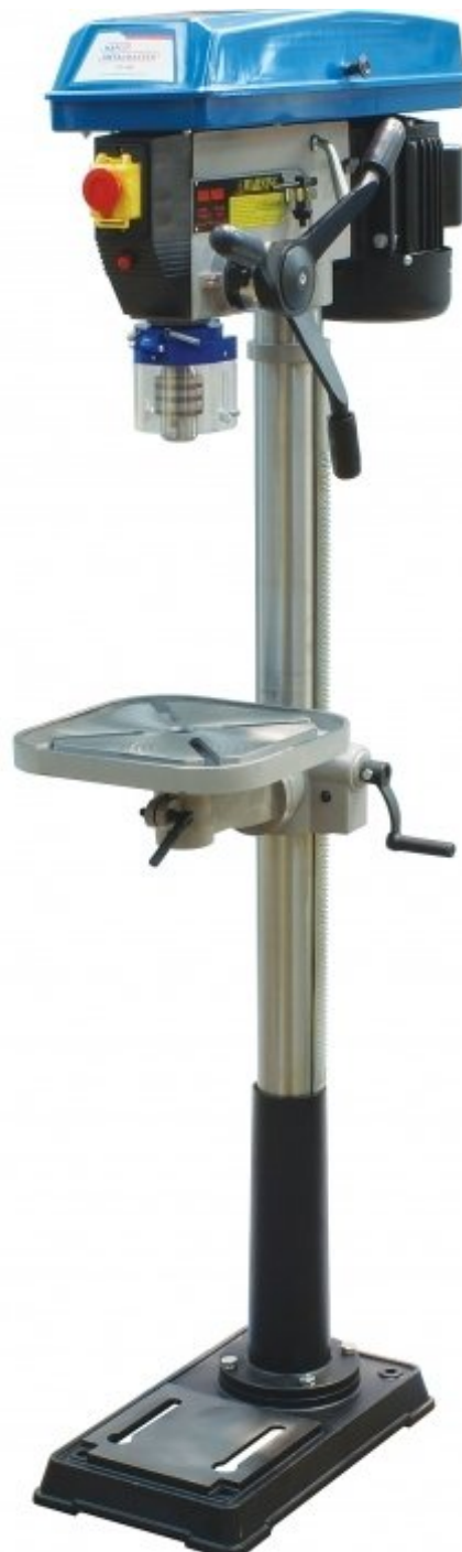
Table Tilts Left & Right To 45° & Rotates 360°