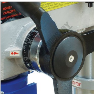
Drilling Depth Stop Setting With Scale