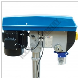
Head Side View