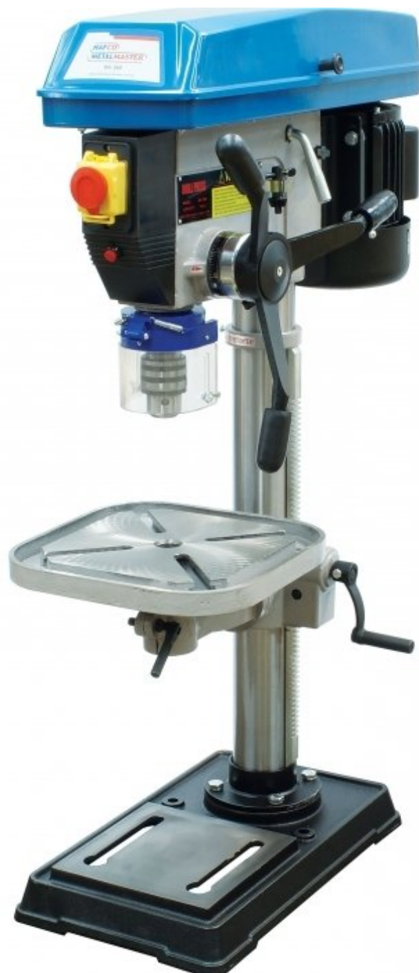
Table Tilts Left & Right To 45° & Rotates 360°