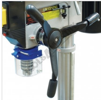
1 Piece Cast Iron Drilling Lever