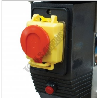
Emergency Stop Switch and Light Switch