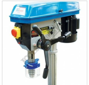
80mm Spindle Travel