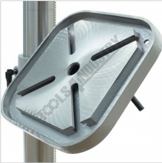
Tilting and Rotating Cast Iron Table