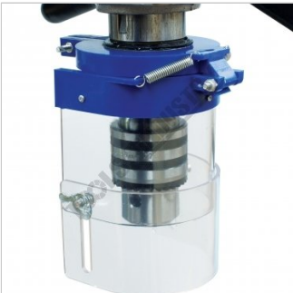
Adjustable Safety Chuck Guard with Flip Up Screen