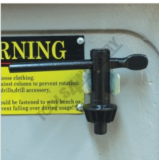
Chuck Key Holder