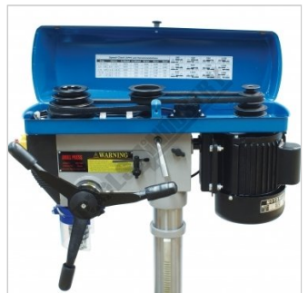
A Section Belt Drive System