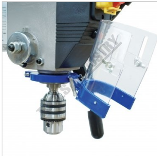
Safety Chuck Guard Flipped Up