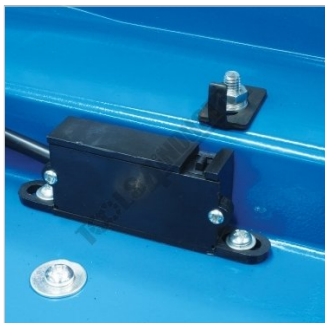
Safety Micro Switch on Pulley Guard