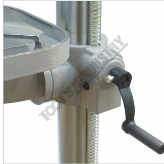
Table Height Adjustment Crank