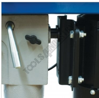
Belt Tension Lever and Lock