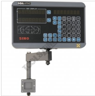
Shown Mounted to Optional DRO