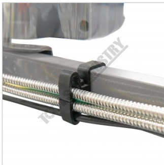
Wire Clips Action Shot