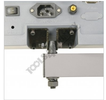
Mounting Close Up with Optional DRO