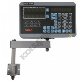
Shown Mounted to Optional DRO Front View