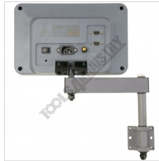
Shown Mounted to Optional DRO Rear View