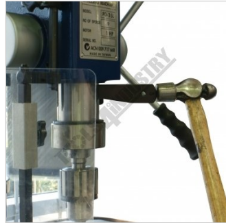
Drill Chuck Being Removed by Drill Drift