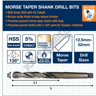
Morse Taper Shank Drill