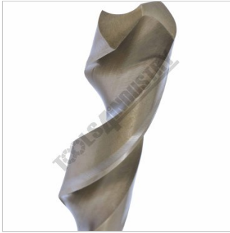
135 Degree Split Point M35 HSS 5% Cobalt