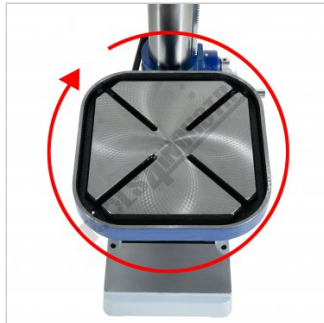
Cast Iron Table Rotates 360 Degree