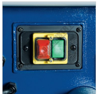
ON / OFF Power Switch