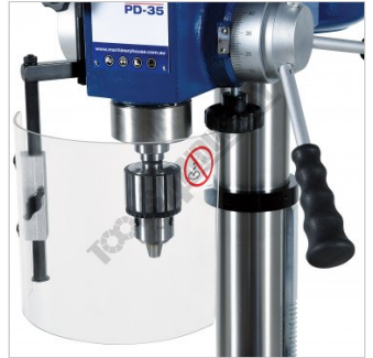
Drill Chuck Safety Guard With Micro Switch