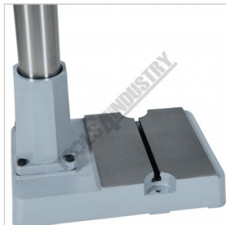
Heavy Duty Base with T Slot