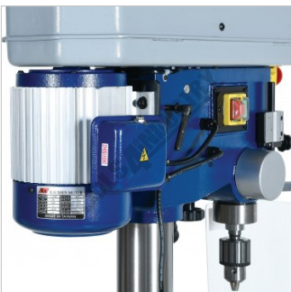
240V 1HP Motor