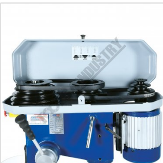
B Section Belt Drive System