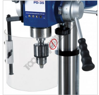
Drill Chuck Safety Guard With Micro Switch