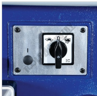
2 Speed Switch