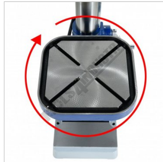
Cast Iron Table Rotates 360 Degree