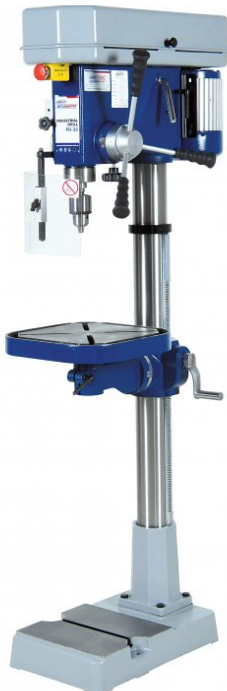
Table rotates 360°