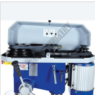
B Section Belt Drive System