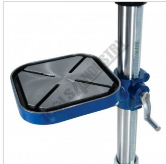
Table Rack Pinion Wind Up