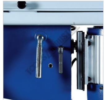
Belt Tension & Lock Lever