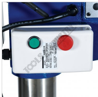
ON / OFF Power Switch