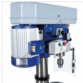
415V 1HP Motor