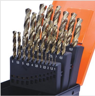
Close up of Set