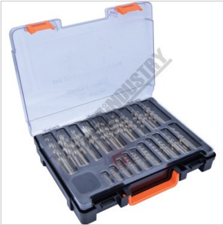
Lid Open with Plastic Cover