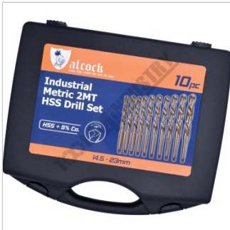
Case Top View