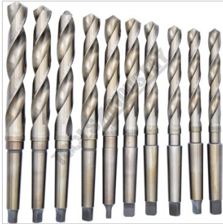
Drill Set Top View