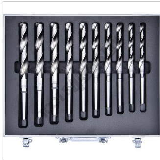
Case Top View