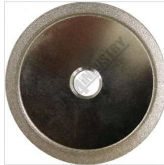
Back Top View