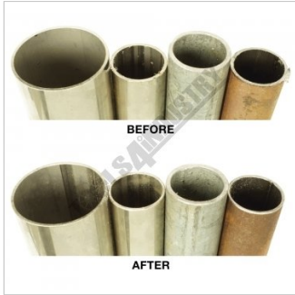
Material Before and After