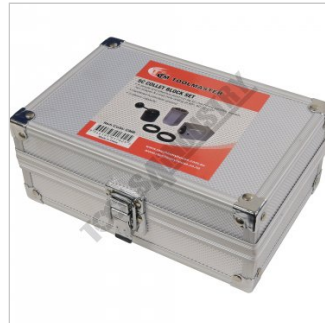
Aluminium Storage Case Closed