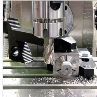
Shown Used with Square Holder