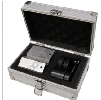
Aluminium Storage Case