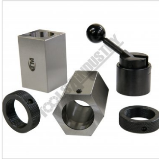
Square, Hexagonal Holders & Collet Clamp