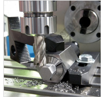
Shown Used with Hexagonal Holder