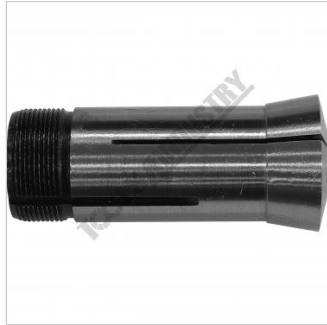
Collet Side View