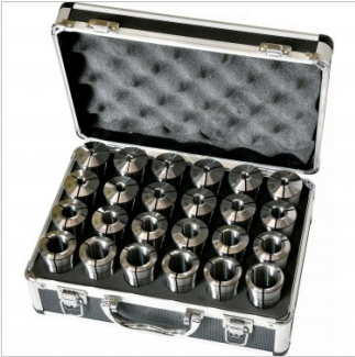
Shown in Case