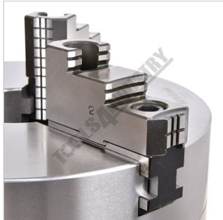
Jaw Rear View