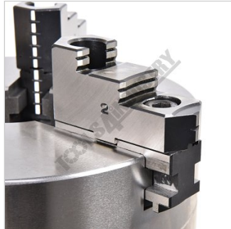
Jaw Rear View