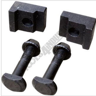
Nuts and Bolts