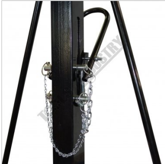
Support Pin Safety Chain with Lynch Pin Clips