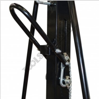
Safety Height Locking Pins