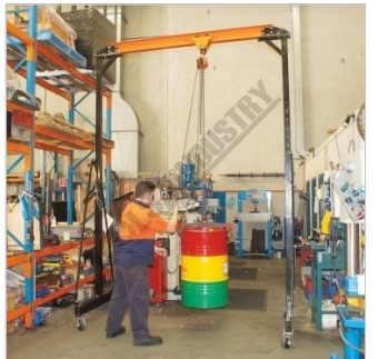
Shown Lifting Oil Drum 2