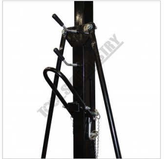
Lever Action Beam Height Adjustment