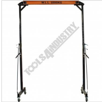
Shown at Full Height