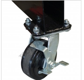
Swivel Wheels with Lock