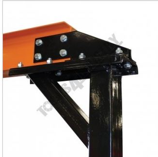
Heavy Duty Beam Support