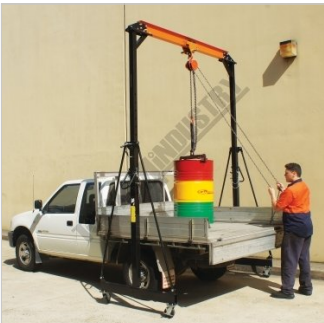
Shown Loading Oil Drum onto Ute