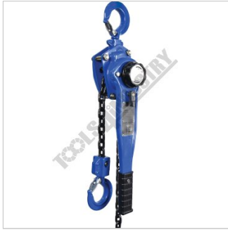
Main View Handle Down