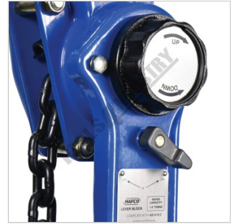
Lever Handle Mechanism