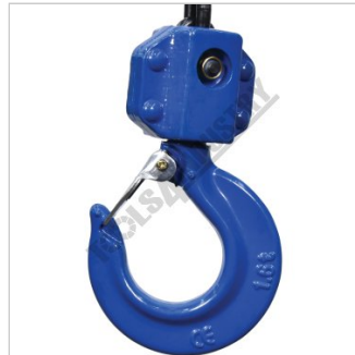
Bottom Hook Assembly