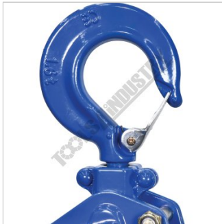
Top Hook Assembly