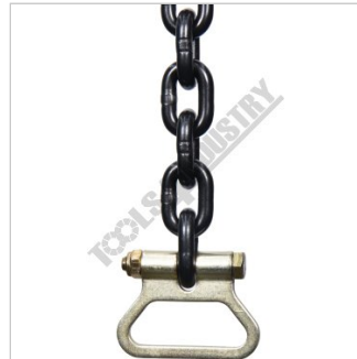
Length Chain End