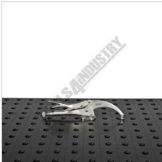
Shown on Welding Table Jaw Closed