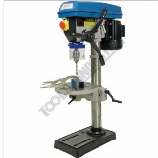
Shown Clamping Job on an Optional Drilling Machine