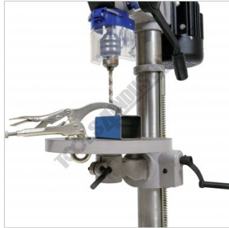
Shown Clamping Job on an Optional Drilling Machine Low View