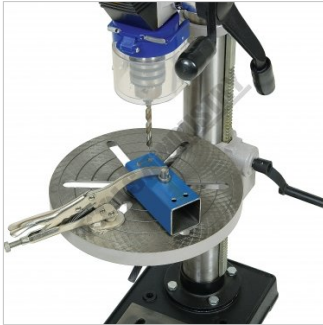
Shown Clamping Job on an Optional Drilling Machine Close Up