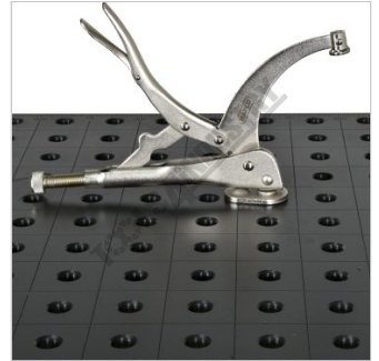
Shown on Welding Table Jaw Open