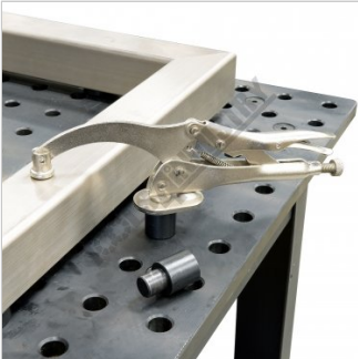
Shown Screwed into Optional Weld Clamp Adaptor W08512