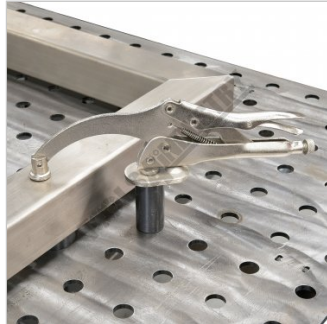
Shown Screwed into Optional Weld Riser W08515