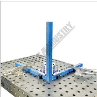
Square Tube Setup with Optional Stops Clamps and Magnetic Squares