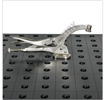
Shown on Welding Table Jaw Open