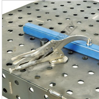
Shown Clamping Square Tube