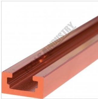
Close Up View