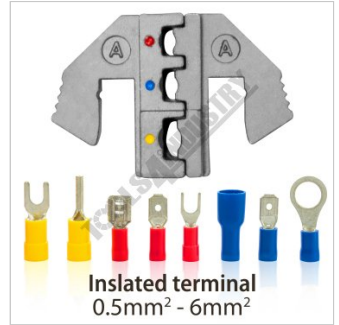
Insulated Terminal Jaw 0.5mm 2 - 6mm 2