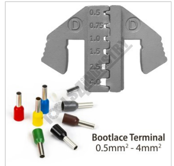
Bootlace Terminal Jaws 0.5mm 2 - 4mm 2