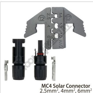
MC4 Solar Connector Jaw MC4 Solar Connector 2.5mm 2 , 4mm 2 , 6mm 2