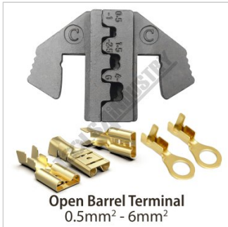
Open Barrel Terminal Jaw 0.5mm 2 - 6mm 2