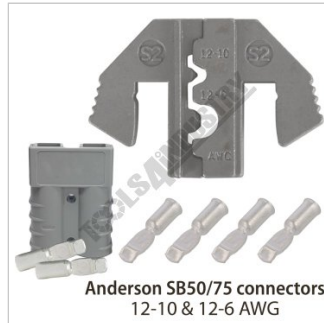
Anderson Plug Jaws Anderson SB50/75 connectors 12-10 & 12-6 AWG