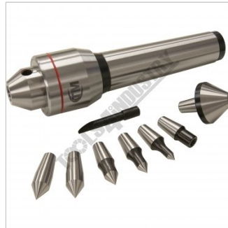
Set Shown With Tips