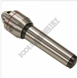
Live Centre Rear View