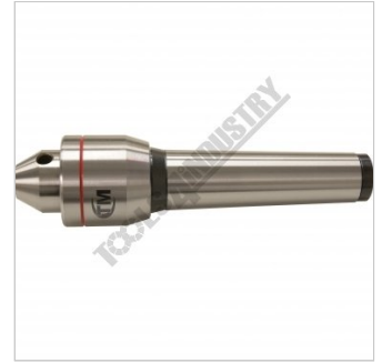
Live Centre Side View