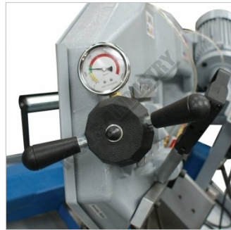
Blade Tension Gauge