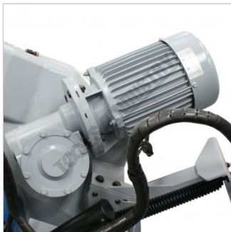
Motor and Gearbox Drive