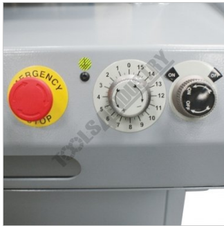
Adjustable Automatic Feed