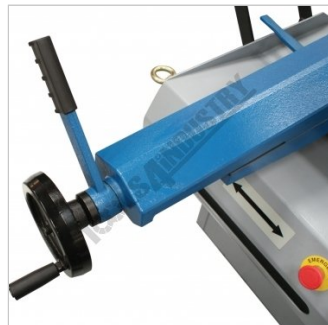
Quick Action Clamp Lever