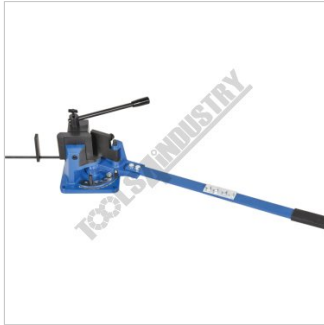
Full View With Handle