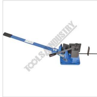
Rear Top View