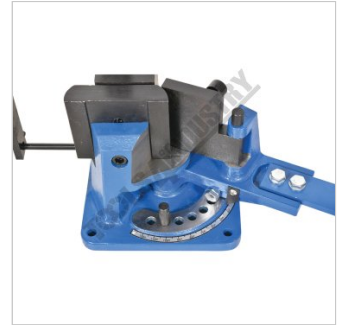
Bending Angle Stop