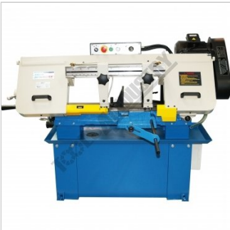
Front View Head Fully Down