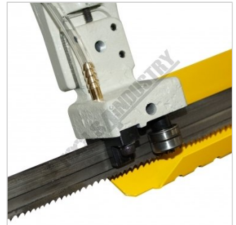
Carbide Blade Guides With Bearings