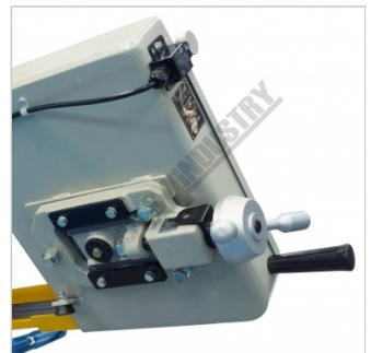
Blade Tension Mechanism