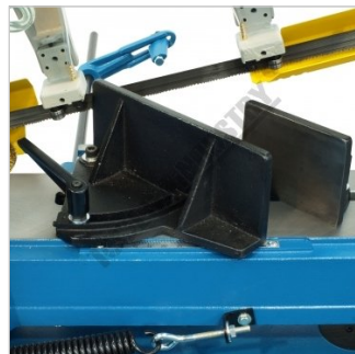
Vice At 45 Degrees