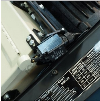
Blade Guard Safety Micro Switch on Right Side