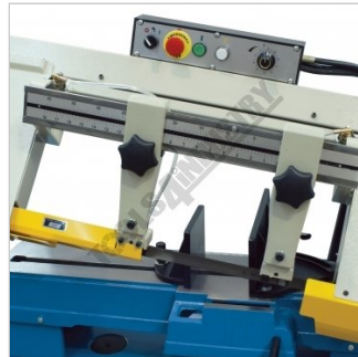
Quick Adjustment Blade Guide System