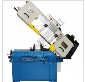
Front View Head Fully Up