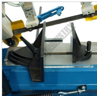
Vice At 0 Degrees