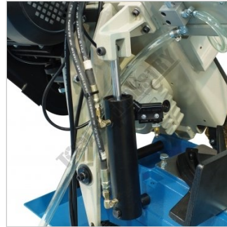
Hydraulic Arm With Automatic Cut Out Switch