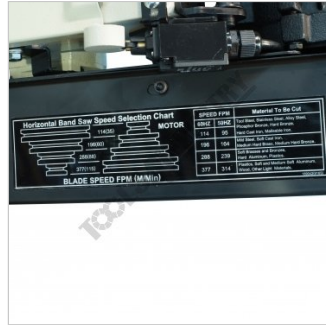
Speed Selection Chart