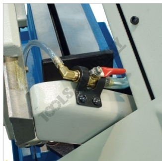
Coolant Shut Off Valve