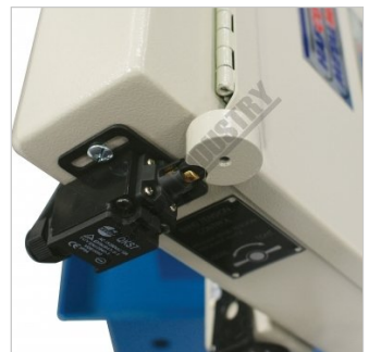
Blade Guard Safety Micro Switch on Left Side