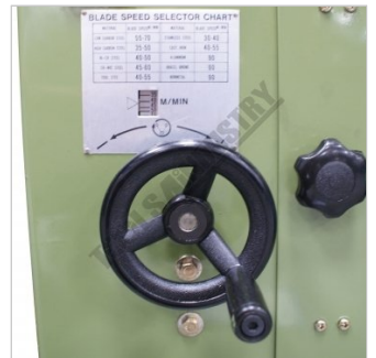
Variable Speed Handle