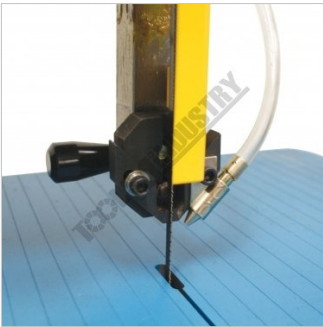
Blade Air Pump