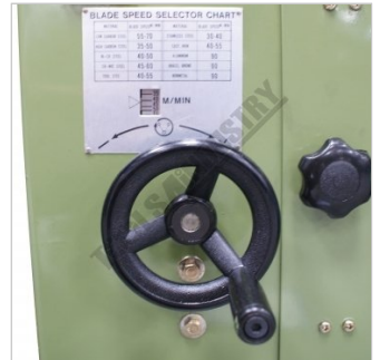
Variable Speed Handle