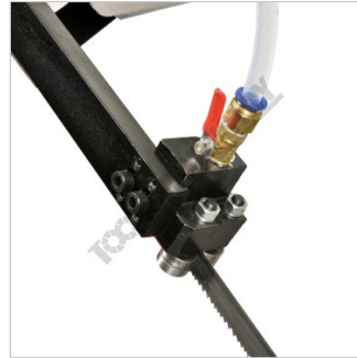
Coolant to Blade