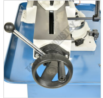
Quick Action Vice Handle Lever