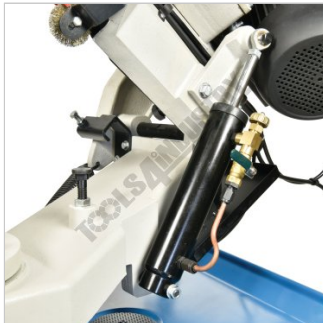
Hydraulic Ram Down Feed Control