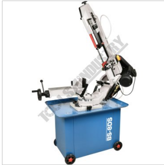
Head Fully Raised