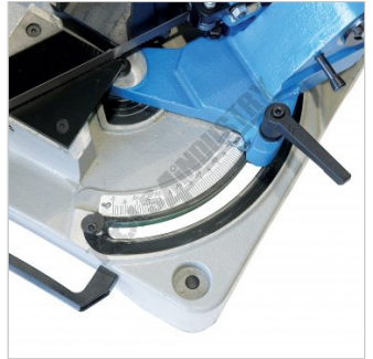
Swivel Head Angle Lock