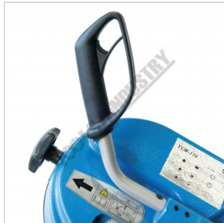
Blade Trigger on off Switch