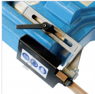
Blade Guide Adjustment