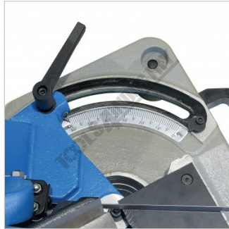
Swivel Head Angle Scale