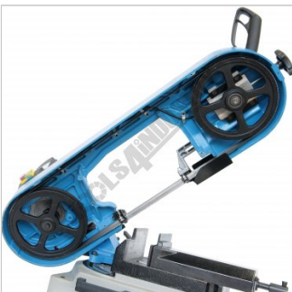
Rear View Blade Guard Off