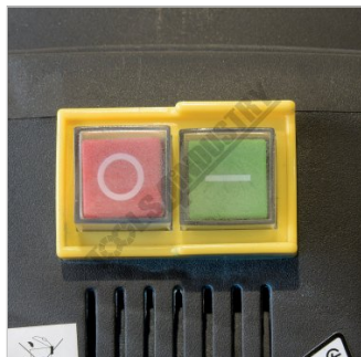
Main Power Switch