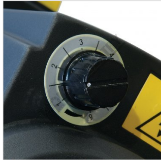
Variable Speed Dial