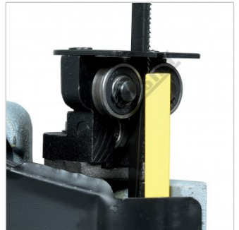
Rear Ball Bearing Blade Guides