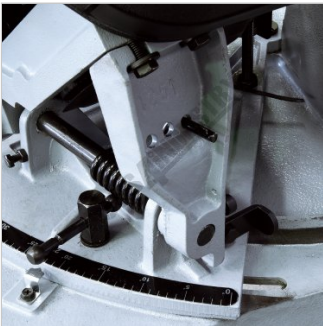
Adjustable Spring To Set Cutting Beam Force