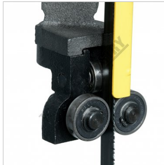
Front Ball Bearing Blade Guides