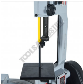
Vertical Cutting Table Close Up