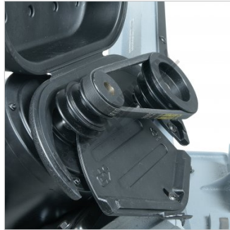
3 Speed Pulley Drive System