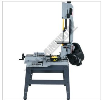
Shown with Vertical Cutting Table