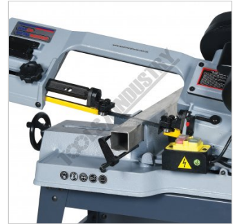
Shown Cutting Steel Tube