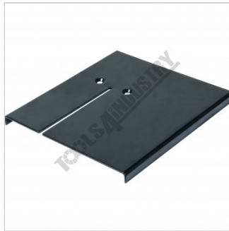
Includes Vertical Cutting Table