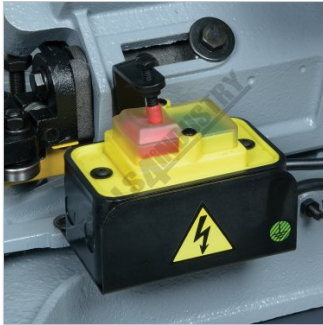
Automatic Electric Cut Out Switch