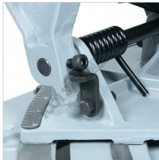
Vertical Head Position Safety Latch