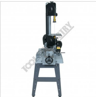
Vertical Cutting Table Front View