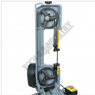
Blade Drive System