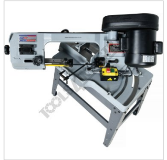
Top View at 45 Degrees