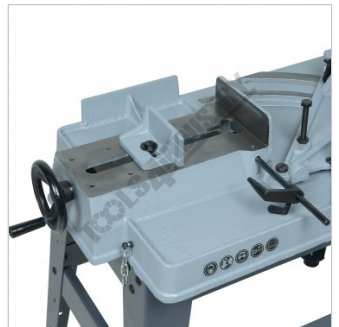
Vice Clamping Fixture