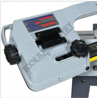
Blade Tension Dial