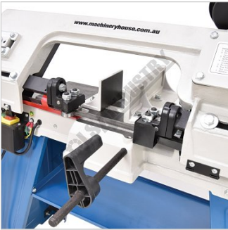
Cutting Area Close Up