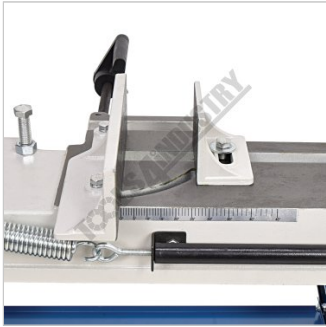
Vice at 90 Degrees