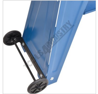
Portable for Site Work