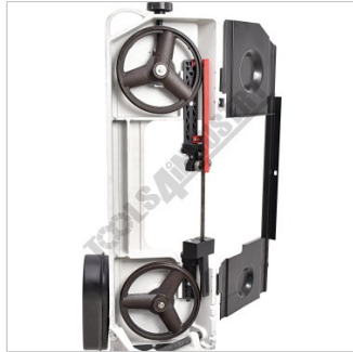
Blade Guard Open