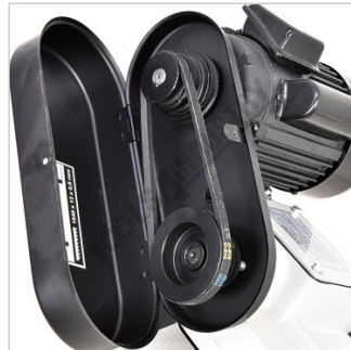
3 Speed Pulley Drive System