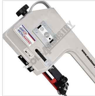
Blade Tension Handle