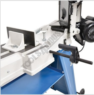
Adjustable Length Stop