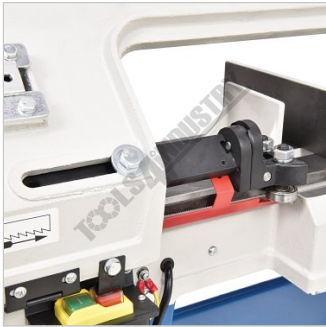
Left Adjustable Blade Guide