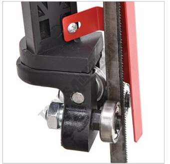
Fully Adjustable Blade Rollers