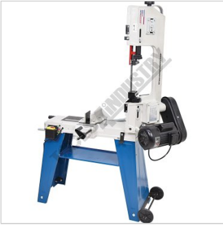
Head Fully Up