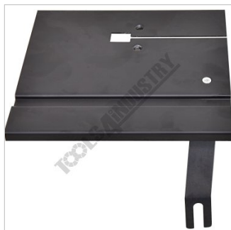
Includes Vertical Cutting Table