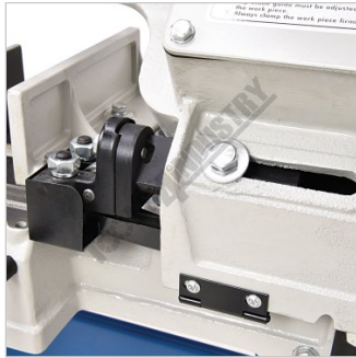
Right Adjustable Blade Guide