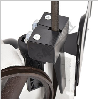
Cover Ready for Vertical Cutting Table