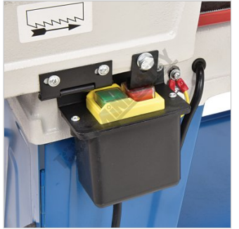
Automatic Cut Out Switch