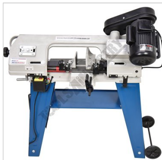
Front View 1