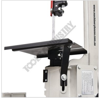
Vertical Cutting Table Attached