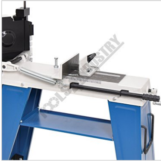
Adjustable Spring Tension to Regulate Cutting Feed Rate