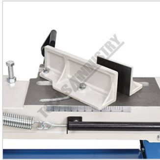
Vice at 45 Degrees