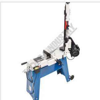
Left Top Full View