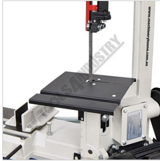
Vertical Cutting Table