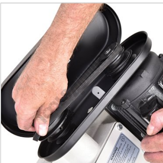
Changing Belt Pulley Speed