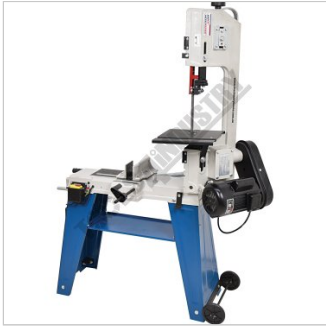
Head Fully Up with Vertical Table