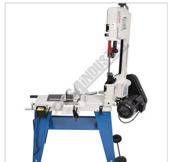
Front View 3