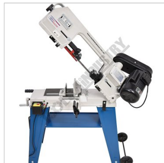
Front View 2