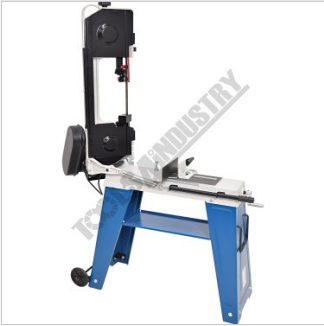
Rear View Head Up