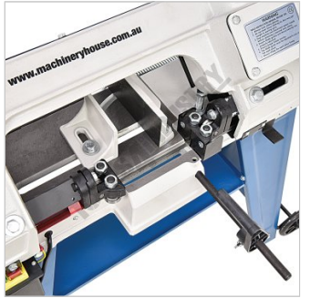
Cutting Area Top View