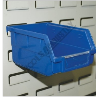
Shown with Optional Buckets