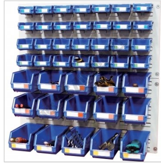
Shown with Optional Buckets and Tools