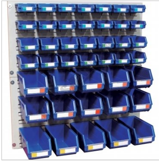
Shown with Optional Buckets on Panels