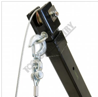
Double Line Ring