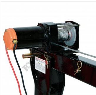
12V DC Winch Side View