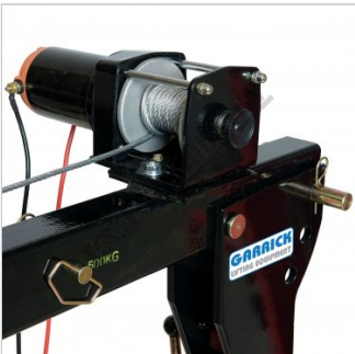
12V DC Winch