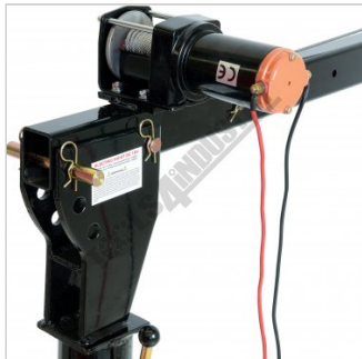
12V DC Winch Rear View