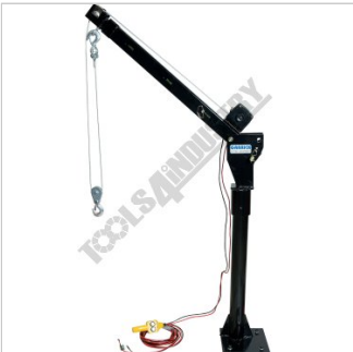
Shown using Double Line Lift Highest Pin Height Position