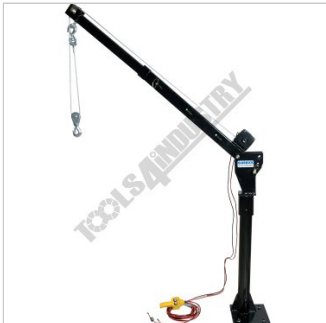
Shown using Double Line Lift Full Extended