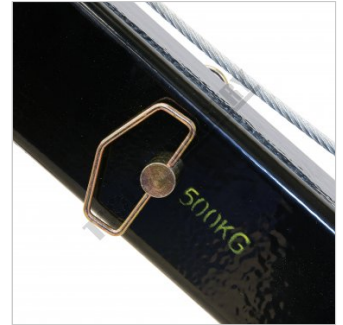
3 x Telescopic Boom Positions 100kg 250kg and 500kg