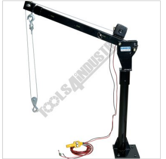
Shown using Double Line Lift Middle Pin Height Position