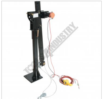
Full Lower Rear View