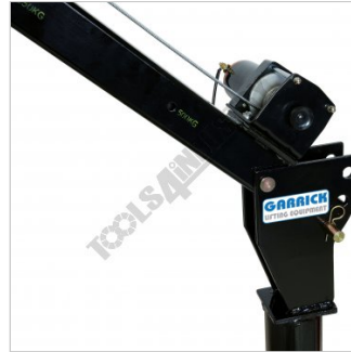
3 Elevation Positions Via Pin Lock System Fully Up