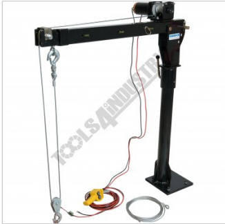
Setup as Double Line Lifting