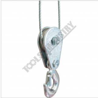
Hook with Pulley