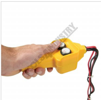
Hand Switch for Easy Control