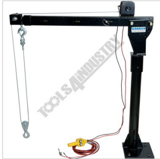
Shown using Double Line Lift Lowest Pin Height Position