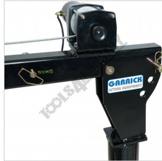
3 Elevation Positions Via Pin Lock System Fully Down