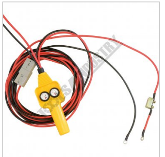
Controller with 12V Leads