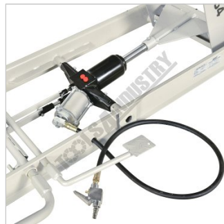
Pneumatic Hydraulic Cylinder and Air Connection