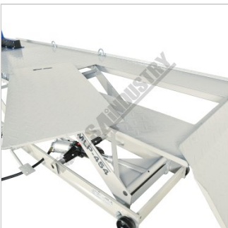
Removable Rear Plate for Maintenance