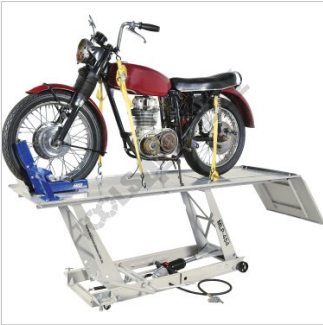
Shown with Optional Motorbike and Straps