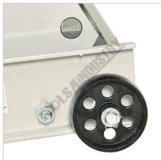
Rear Caster Wheels