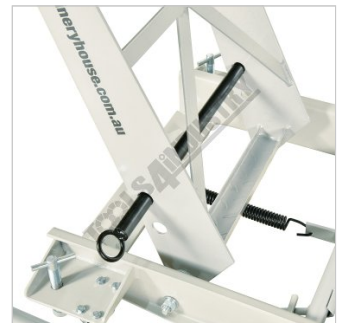
Two Position Safety Locking Bar