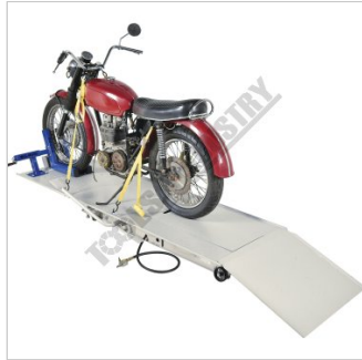
Shown with Optional Motorbike and Straps Rear View