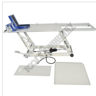
Shown with Mounting Plates Off