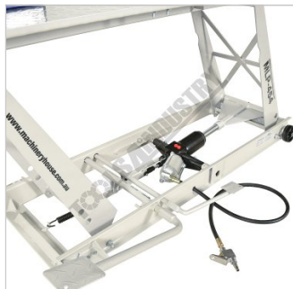
Pneumatic Hydraulic Cylinder