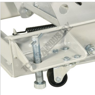
Front Swivel Wheels and Adjustable Stops