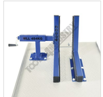
Front Wheel Clamp Adjustment