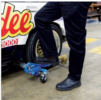
Hydraulic Foot Pump