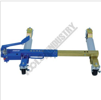
Front View Extended