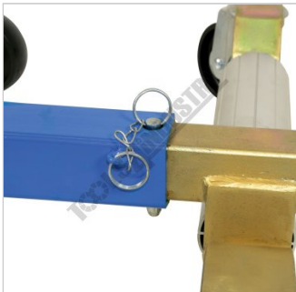
Lock Pin For Ram