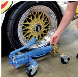
Inserting Safety Lock Pin