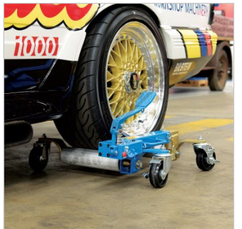
Wheel Jacked Ready to Move Vehicle