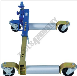
Side View Extended