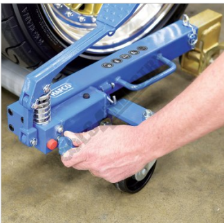
Closing Release Valve Ready for Pumping Jack