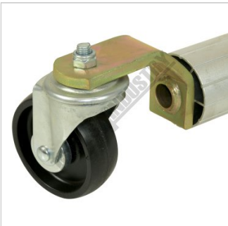
2 x Swivel Wheels