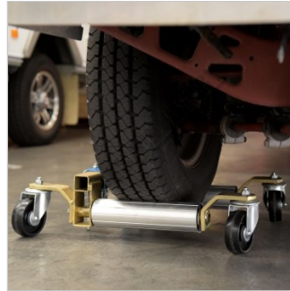
Shown Lifting Small Truck Wheel Front View