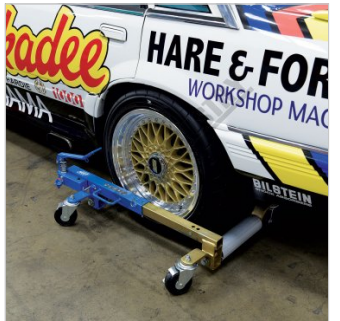
Positioning Jack in Place 2