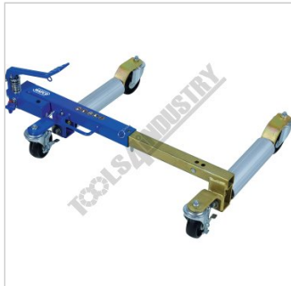
Right Side Extended