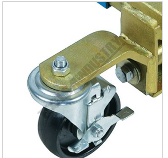
2 x Swivel Brake Wheels