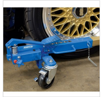
Foot Pedal Position Lock