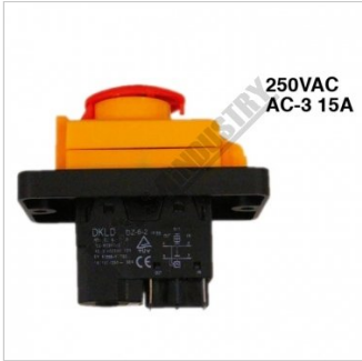
2BC0226 Switch 250V Side View