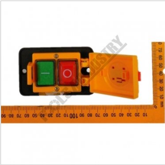
2BC0226 Switch 250V Lid Open